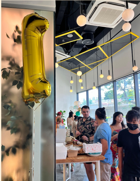
YEASTSIDE @ KAP MALL 9 King Albert Park, #01-09, S598332