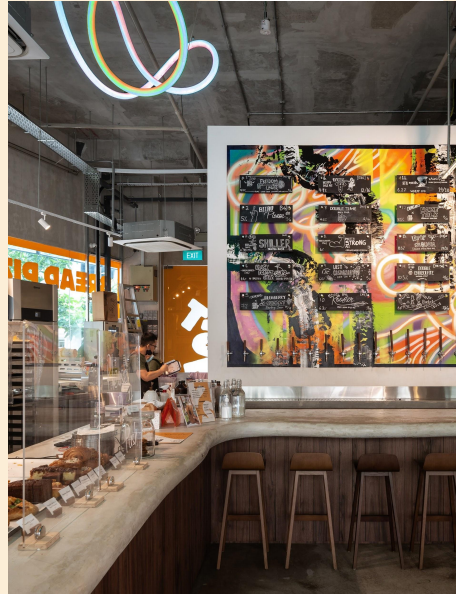
YEASTSIDE @ FARRER PARK 2 Perumal Rd, #01-06, S218773