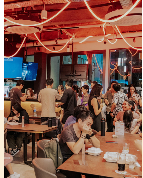
TRIFECTA SINGAPORE 10A Exeter Rd, #01-02, S239958